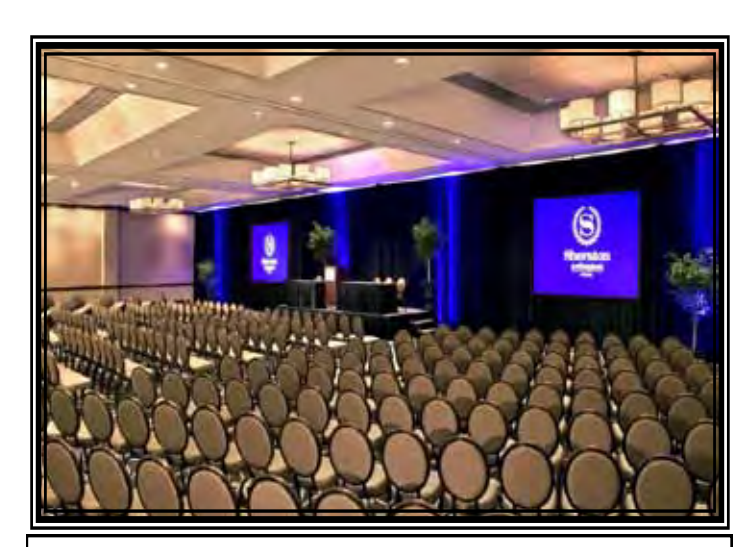
TEXAS TURFGRASS SUMMER CONFERENCE SHERATON HOTEL ARLINGTON, TEXAS JULY 7-9, 2013