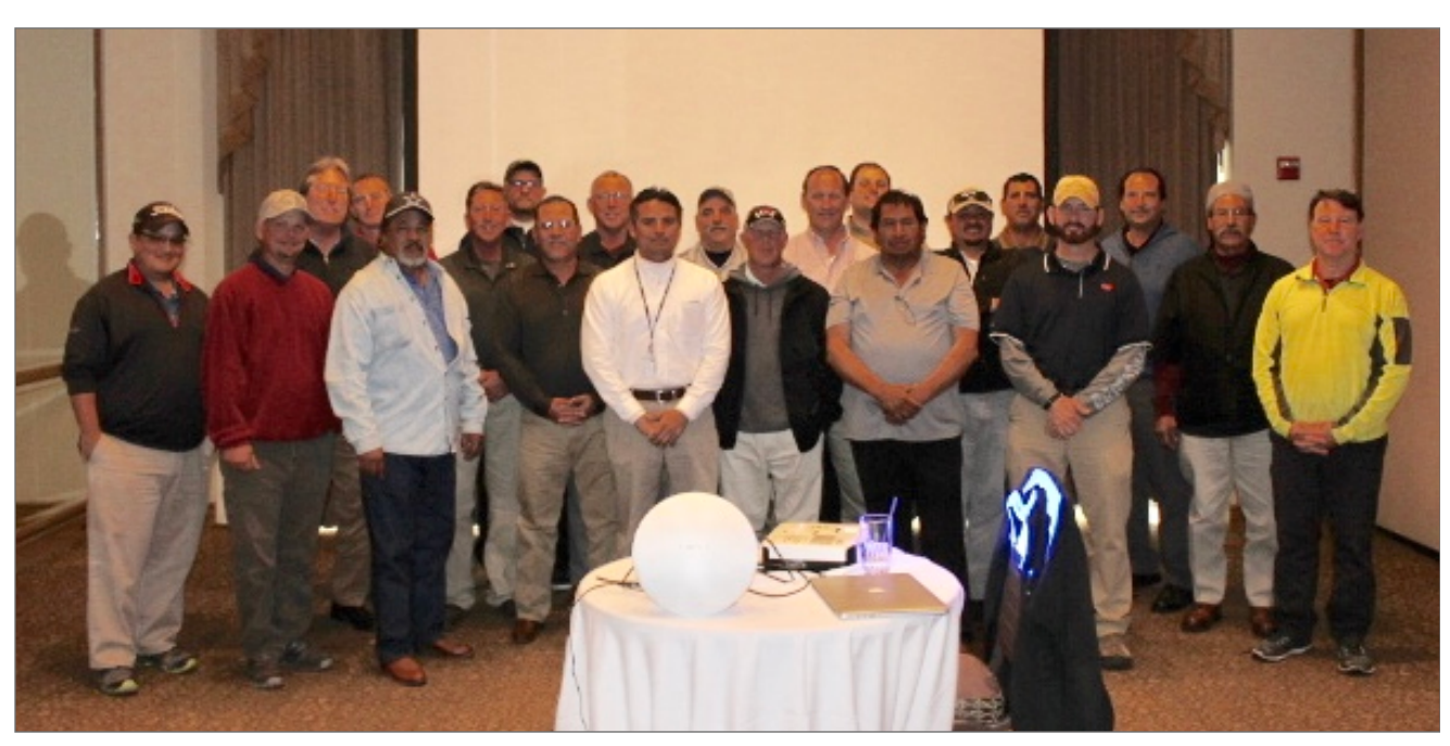
January at McAllen Country Club