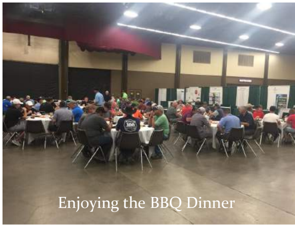
Enjoying the BBQ Dinner