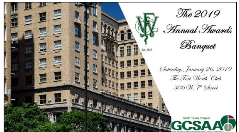
Save the Date! January 26, 2019