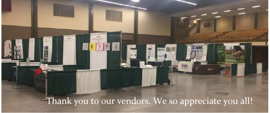
Thank you to our vendors. We so appreciate you all!