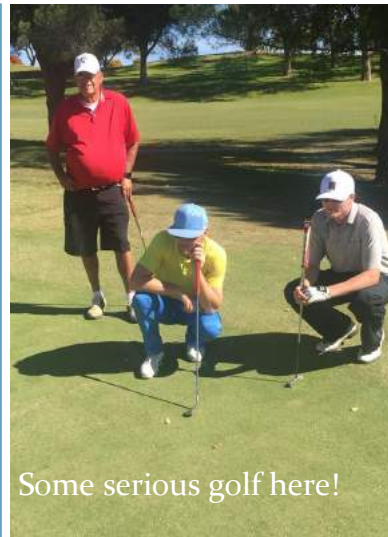
Some serious golf here!